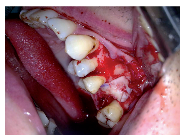
Fig. 4. Intra-operative view showing stabilized auricular cartilage on the bone defect.

and palatal flap commonly used for closure of the OAF in the review of the literature. Our experiences show us that these methods are not sufficient for closure of OAF which has large bone defects and these techniques can be used single after surgical failure. In additionally, conventional techniques can reduce vestibular depth and cause lack of bone support (6,7).