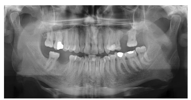
Fig. 5. Six-month post-operative panoramic radiograph showing the defect filled new bone.