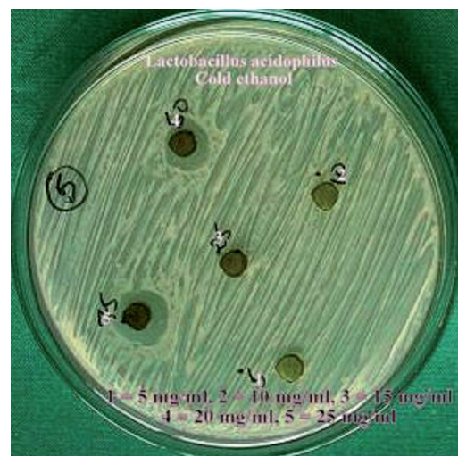
Fig. 3. Minimum Inhibitory Concentration (MIC) of Citrus sinensis peel extracts against dental caries pathogens on specific media for each microorganism.