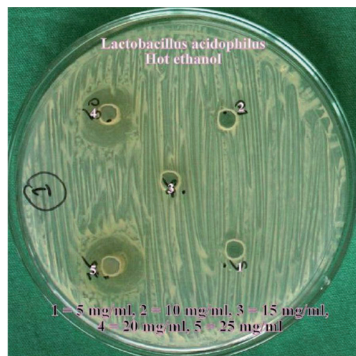
Fig. 4. Phytochemical analysis of orange peel extract.

alkaloids, carbohydrates and glycosides, tannins and phenolics, saponins and flavonoids. Triterpenoids were only present in ethanolic extract.