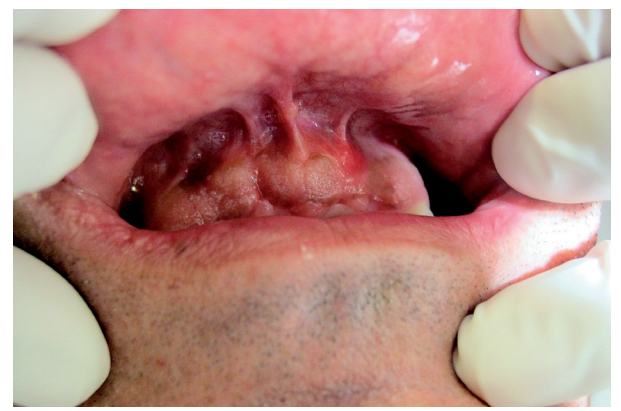
Fig. 1. Histological images of the pyogenic granuloma showing an appearance similar to granulation tissue. The histological type of the pyogenic granuloma is non-lobular capillary hemangioma. Arrow heads label blood vessels surrounded by connective tissue.

The aim of the present article is to make a systematic review of all the published cases, as to actualize and evaluate ethiologic factors and it clinicopathologic characteristics.