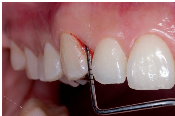
Fig. 1: Bleeding on probing.

adjusted final model. The usual applicability hypotheses were validated for the optimized model: normality of residuals, homoscedasticity, autocorrelation (Durbin-Watson) and non-colinearity. The accepted statistical significance level was 5% ( \alpha=0.05 ).