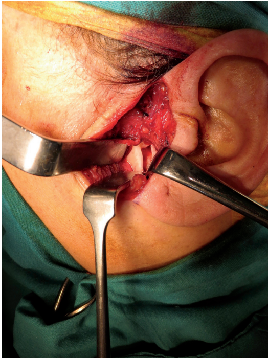
Fig. 3. Intraoperative view of the lesion through cortical neck bone reabsorption.

The histopathology showed a conglomerate of adipocytes without bone trabeculae, calcifications or atypia (Fig. 3). The pathological findings confirmed the definitive diagnosis of intraosseous lipoma. Now, after 20 months, the patient remains free of symptoms and shows no sign of recurrence. Patient informed consent has been obtained for the publication of this article.