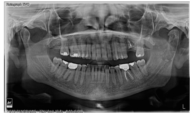
Fig. 1. Orthopantomography. Left mandibular ramus and left condylar neck radiolucid lesion.

a radiolucent, multi-lobed, well circumscribed lesion, in the left mandibular ramus and condyle (Fig. 1). A computed tomography scan (CT) showed a well-defined multi-lobed radiolucent lesion with septa within, of 41 x 11mm craniocaudal and anteroposterior axes respectively, with values of attenuation in the range of fat. The lesion was located posterior to the alveolar nerve channel, and a thinning and a focal discontinuity of the vestibular cortex could be appreciated in the mandibular ramus. A magnetic resonance imaging (MRI) revealed a hyperintense lesion in T1 and T2 weighted sequences, a typical signal of fat (Fig. 2). All these features were consistent with the diagnosis of intraosseous lipoma. A biopsy under general anaesthesia using a preauricular approach was performed. During surgery, a well-defined resorption of the external cortex of the left mandibular ramus and the condylar neck could be seen, as had been anticipated by the CT image. The lesion was located in the mandibular medullary cavity and had the appearance of fatty tissue. Resection was performed by curettage and filling the defect was not considered to be necessary.