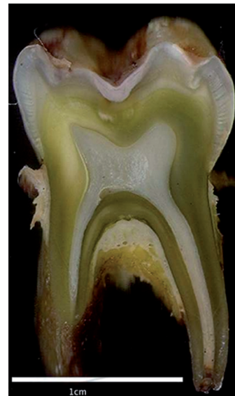
Fig. 1: Macroscopic view of a longitudinal section of a green primary molar from one of the studied patients.

Sixteen primary green teeth were prepared and divided into two groups. In the group of green teeth, eight teeth were selected: two (25%) canines and six (75%) incisors. In the control group, eight teeth from healthy children were used: two (25%) canines and six (75%) incisors. The control teeth were matched with green teeth so that each group had the same amount of teeth in the same anatomical group and also paired by patients' age. All teeth were prepared based on previous studies (17,18)