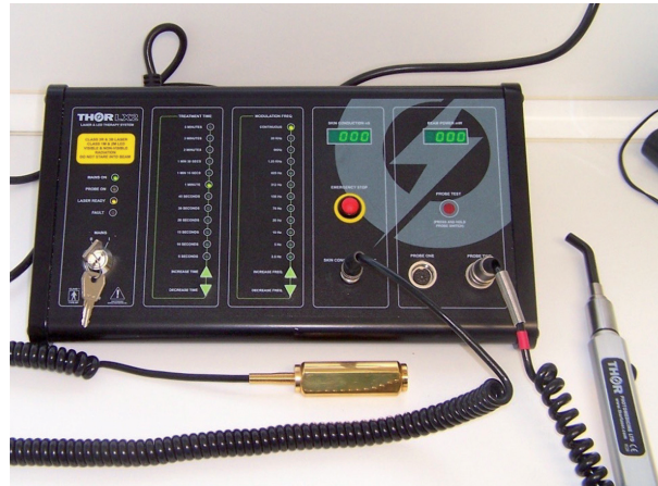
Fig. 1: Diode laser THOR LX2 ® (Thor Photomedicine Ltd, Chesham, London).

Age, gender, smoking and plaque index were gathered. For the 2 test teeth and the 2 control teeth: recession (the highest point), probing (of the highest point of recession) and the degree of dentin hypersensitivity using visual analog scales (VAS) for tactile stimulation (touching the