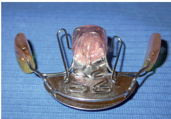
Fig. 2: Anterior bite plane functional appliance (ABPFA).

the major issues is to isolate modifications of craniofacial structures induced by normal growth from the therapeutic effects of appliances (i.e. modifications of craniofacial structures attributable to the appliances). This can be accomplished only by comparing data of treated patients with a matched untreated control group, which is often very difficult to make, due to the obvious ethical implications of leaving patient without treatment.