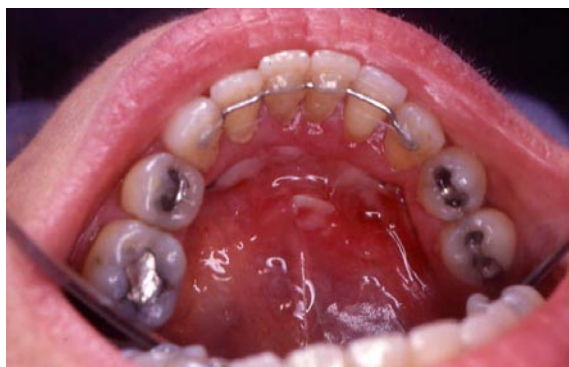
Fig. 2. Ulcerations in the floor of the mouth following alendronate administration.

In the past 4 years there have been publications describing numerous cases of a special form of osteonecrosis of the jaws (ONJ) in patients affected with myeloma or breast cancer and in treatment with high effectiveness BPP, especially pamidronate and zoledronic acid and more rarely with alendronate (47-50).