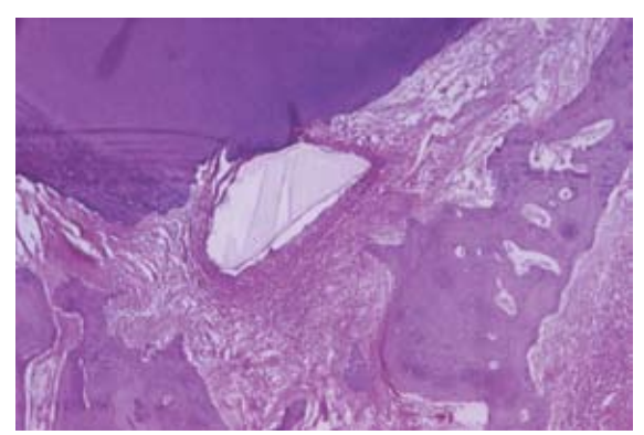
Fig. 3. Fragment of expulsed componer surrounded by granulation tissue (Hematoxylin-eosin, x5).

As to bone formation, the results obtained indicate that little bone (10%) was found in the periapical area three months after obturation. Other authors have reported greater formation of bone tissue. However, such studies were carried out under different circumstances, with placement of the study material in rabbit tibial or femoral bone (10,11,20), or involving evaluation after 6 months (13). In relation to the formation of other tissues, over half of the specimens presented granulation tissue in direct contact with the surface of the retrograde filling material (64%) – in coincidence with the observations of DeGrood et al. (10), Zetterqvist et al. (13), and Maher et al. (23). On evaluating the growth of root cement, no statistically significant differences were observed between the two groups (silver amalgam and compomer), though retrograde filling with componer did yield a comparatively larger proportion of samples with cement growth (48.14% versus 34.78%). In concordance with these results, different authors have shown glass ionomer to favor the formation of bone tissue and root cement in the vicinity (14,25). Root cement growth is an important histological finding, indicative of correct periapical healing.