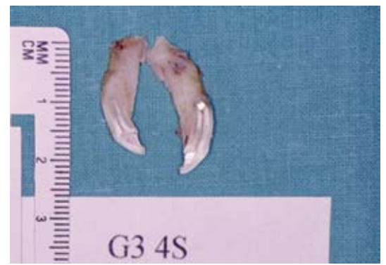
Fig. 1. Macroscopic section of the periapical area with silver amalgam (Hematoxylin-eosin, x10).

Sagittal sections were cut along the longitudinal axis of the teeth, to facilitate examination of the retrograde filling and periapical area (Figure 1).