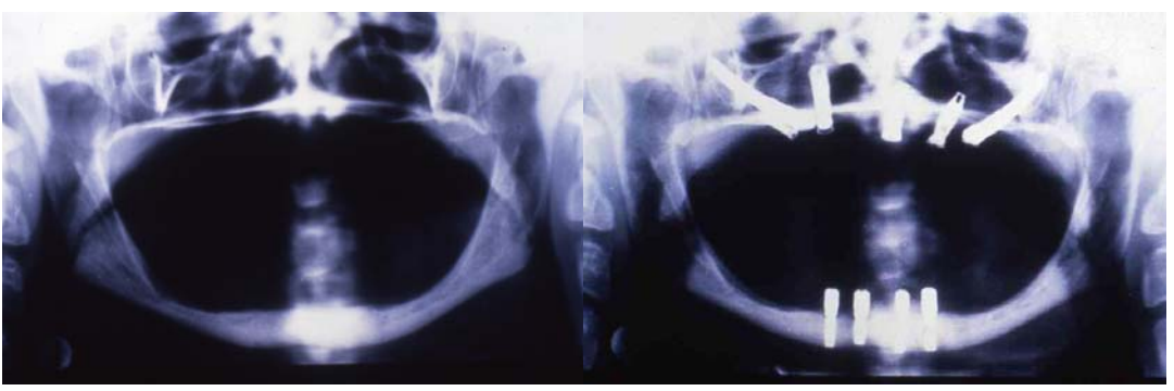
Fig. 1. A) Preoperative panoramic X-ray view of a patient with maxillary atrophy. B) Postoperative panoramic X-ray view of rehabilitation with two zygomatic implants and three standard implants in the anterior zone of the upper maxilla.

maxillary bone, and to discard possible maxillary sinus pathology.