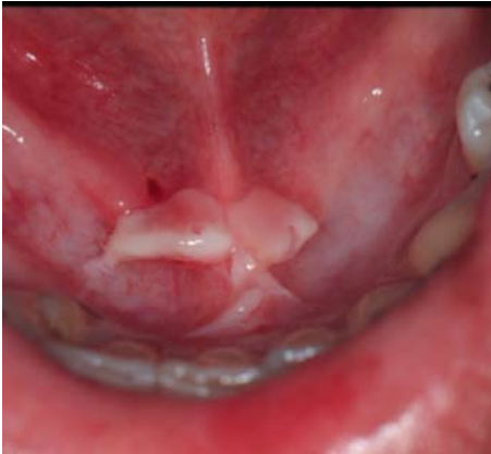
Fig 1. Ulceration on the sublingual caruncula region.