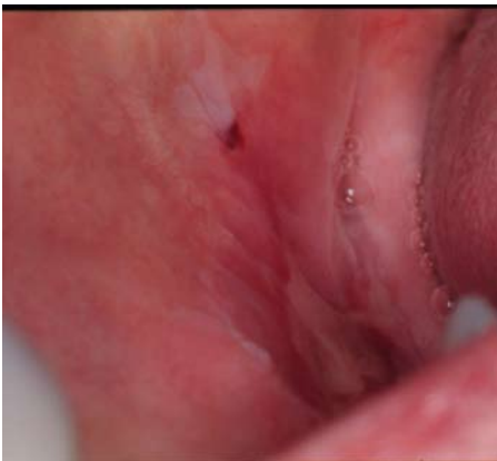
Fig 2. Ulceration in the posterior region at the fornix of the vestibule on the right side.