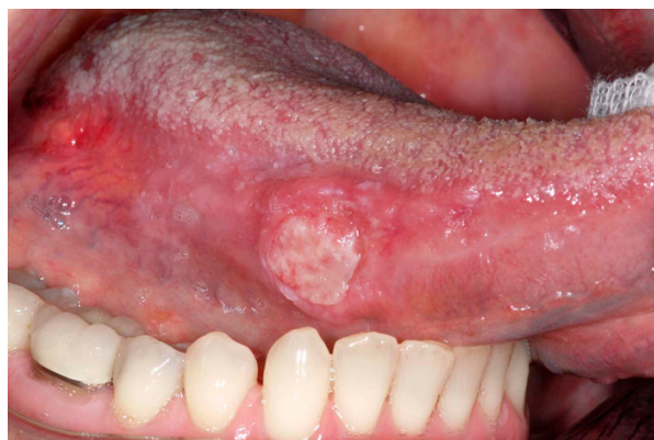
Fig. 3. Relatively small (T1) squamous cell carcinoma of the border of the tongue.