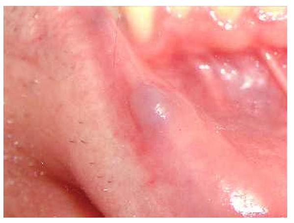
Fig. 1. A small well-defined mass of the lower lip. Note the bluish aspect of the tumor (case 1).

A 53 year-old male presented with a slightly bluish painless fibrous nodule with a smooth surface, measuring 0.8 x 0.5 x 0.5 cm in the upper lip, lasting 5 months. Medical history was non-contributory. Clinical diagnosis included fibrous hyperplasia, hemangioma,