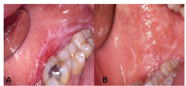
Fig. 2. Evolution of the lesions after SAR replacement. A: Before amalgam removal, B: Three months after.