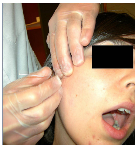
Fig. 2. Needling with a 40 mm. sterile needle and removal the plastic guide-tutor, followed by movements of rotation and input-output to enhance the elimination of myofascial pain.