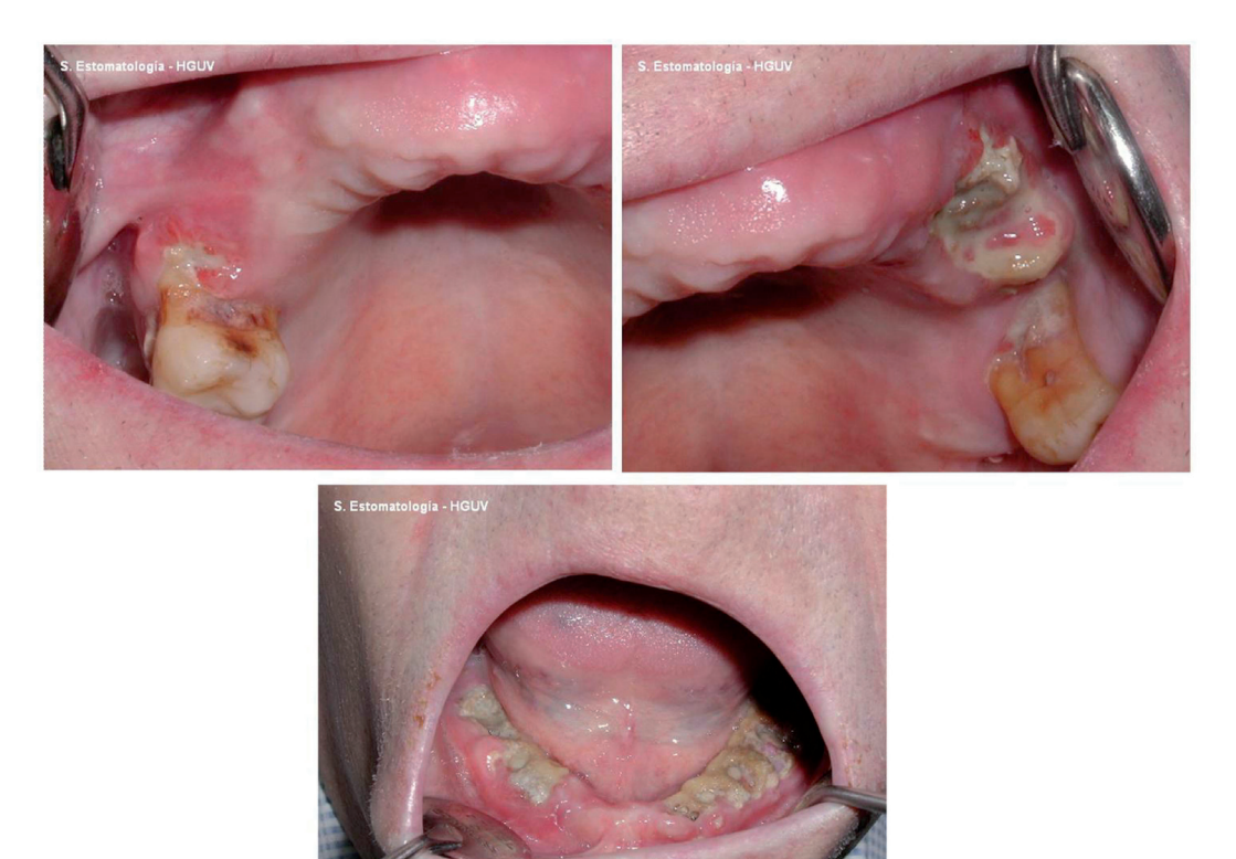
Fig. 1. Images of one same patient with multiple bone exposure sites, corresponding to intravenous bisphosphonaterelated osteonecrosis of the jaws.

Considering the natural tendency of intravenous BRONJ lesions to progress and spread over time (Fig. 1), the