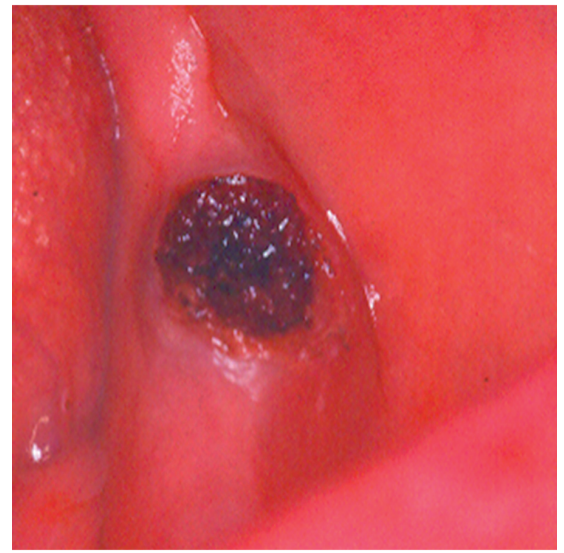
Fig. 3. The surface of the vascular lesion after the ILP technique. Laser irradiation at 2W in CW lead to an ischemic area (ILP technique).

In every case, postoperative tissue sloughing occurred within few days. All the patients healed completely by