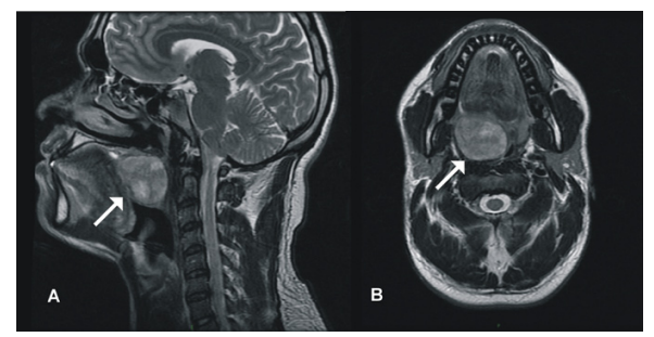
Fig. 3. A) Sagittal MRI showing lesion in the soft palate and there is total obstruction of the naso-oropharynx. B) Axial MRI with lesion found to the right of the midline dependent on the soft palate.

the soft palate which produced sensation of a foreign body and has been present for 1 year. Physical examination showed an ulcerated 3-cm diameter tumor. MRI revealed a predominantly solid lesion with some linear punctate hyperintense areas located in the soft palate and anterior pillar of the oropharynx in the right parasagittal margin, which measured 40 x 39 mm and caused a decrease in the amplitude of the oropharynx (Fig. 3). Under general anesthesia, surgical excision of the lesion with transoral laser surgery and primary closure for preservation of the soft palate was performed. The pathology report informed a diagnosis of pleomorphic adenoma. The surgical specimen measured 4.3 x 3.5 x 3.2 cm with neoplasm in close proximity to the surgical margins, and for this reason surveillance of the patient was decided upon. At 18 months postoperatively, the patient demonstrated no evidence of tumor activity, and function of the soft palate is preserved.