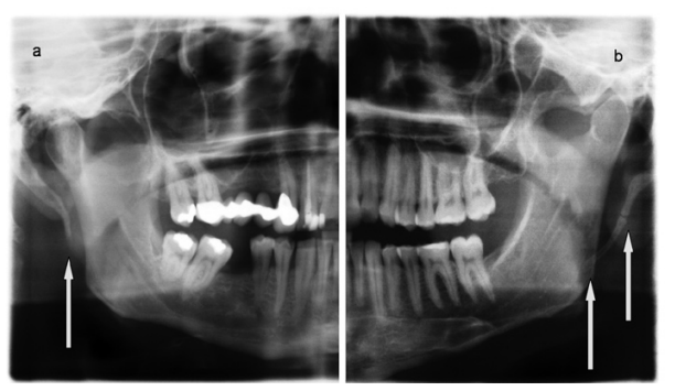
Fig. 1. Conventional panoramic view of two patients with an Eagle's syndrome. The calcified, elongated styloid process was elongated (a) or pseudo-articulated (b).

Amongst others the treatment depends also on the specialist who first saw the patient. The non-invasive management is the first line for the neuropathic sequelae of the Eagle's syndrome (15). So many patients with a unspecific neuralgia caused by Eagle's syndrome are treated pharmacologically by the application of nonsteroidal anti-inflammatory medications or even carbamazepime, valporate, gabapentin or amitriptyline