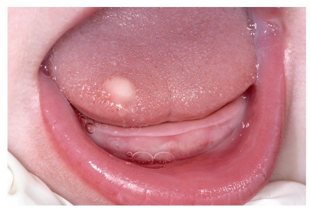
Fig. 1. Granular cell tumor of the tongue in a 5-months-old baby.