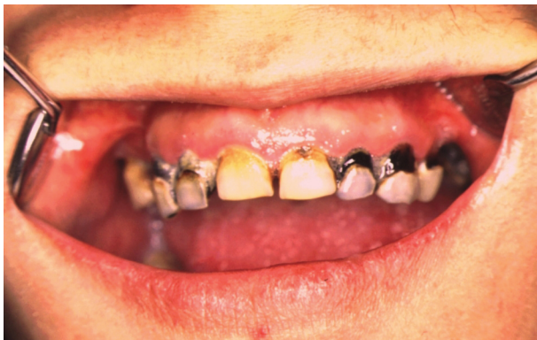
Fig. 1. A clinical case of initial “meth mouth” in a young drug addict.