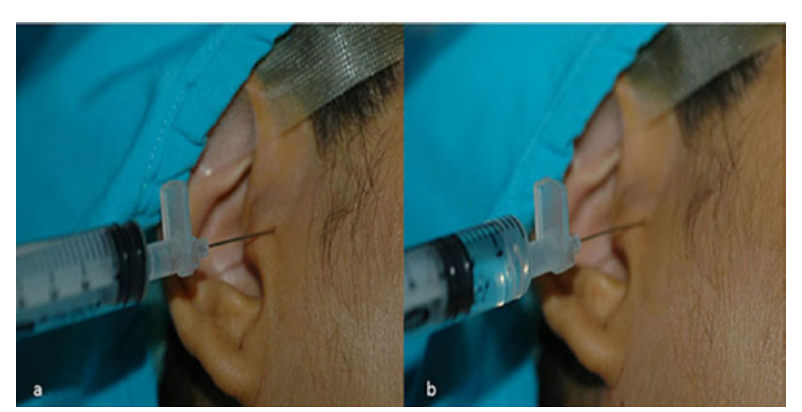
Fig. 1. Injection (a) and aspiration (b) of saline into upper joint space of TMJ.