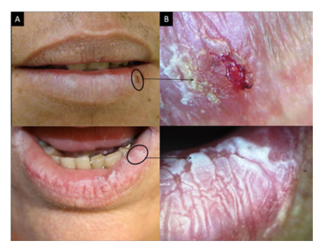
Fig. 4. Actinic cheilitis. A. Photographic image; B. Videoroscopic image.

Table 2 . Distribution of the number and percentage of lesions identified in the lower lip by oroscopy (n = 278) and videoroscopy (n = 557) in 80 evaluated patients.