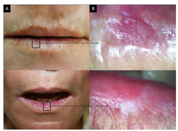
Fig. 2. Actinic cheilitis. A. Photographic image; B. Videoroscopic image.

gram of the lip, only the results from the lower lip were considered when comparing the efficiency between oroscopy and videoroscopy methods because the lower lip was the most affected region. From the lower lip results, 720 regions were examined; a physical exam identified 278 lesions, and videoroscopy identified 557 lesions (Figs. 2A, 3A and 4A regarding oroscopy view, and Figs. 2B, 3B and 4B regarding videoroscopy view). Our primary findings obtained from the data collected by oroscopy paired with videoroscopy regarding the three most frequent lesions of the lower lip are as follows: 64/173 regions exhibited erythema, 92/214 regions contained white lesions, and 84/118 regions exhibited brown stains (focal or diffuse area with color alteration ranging from light to dark brown). These data exhibited a significant increase in the incidence of diagnosis (p < 0.05) when videoroscopy was used (Table 2). Although the absolute number of lesions encountered by videoroscopy was significantly higher than those encountered by oroscopy, the frequency of each type of lesion was not significantly different. Other lesions