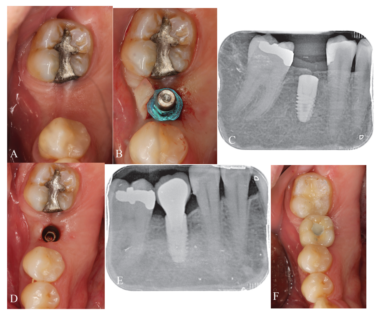
Fig. 2. Subcrestal group. A) Interdental space in the fourth quadrant. B) Implant placement at subcrestal level. C) Periapical X-ray view of the implant at the time of placement. D) Healed gingiva after three months. E) Periapical X-ray view of the implant after 12 months of follow-up. F) Screwed definitive prosthesis.

7 days, 600 mg of ibuprofen (Bexistar®, Laboratorio Bacino, Barcelona, Spain) to be taken as needed, and a 0.12% chlorhexidine mouthwash (GUM®, John O. Butler/ Sunstar, Chicago, IL, USA) for use twice daily during two weeks. Gentle brushing with a chlorhexidine toothpaste was also recommended. Sutures were removed 8-10 days after surgery. Prosthetic loading in the maxilla was carried out after 8-10 weeks following implant placement, and after 6-8 weeks in the case of the mandible.