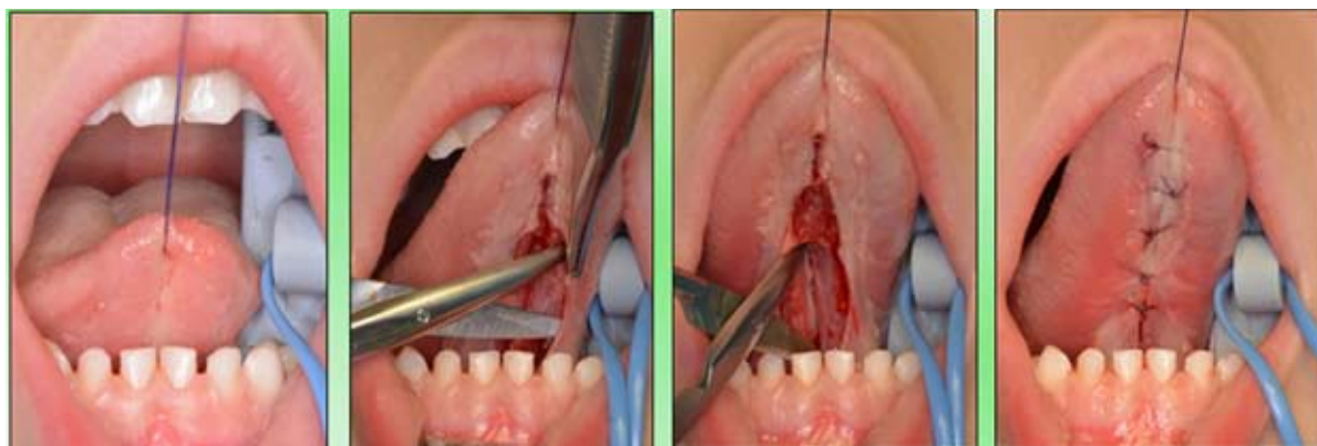
Fig. 2. Surgical Technique. Frenectomy, rhomboid plasty and myotomy.

Degree 4: Conceptual definition: It is a frenulum with a rather reduced level of lingual mobility; the tongue is low but the base of the tongue and frenulum can still be observed. The degree is severe and consequently requires surgery. Operative definition: The patient is requested to lift the tongue and only a quarter of the intraoral space is reached; it is a tongue with reduced movements and hence, bone growth and oral functions are impeded.