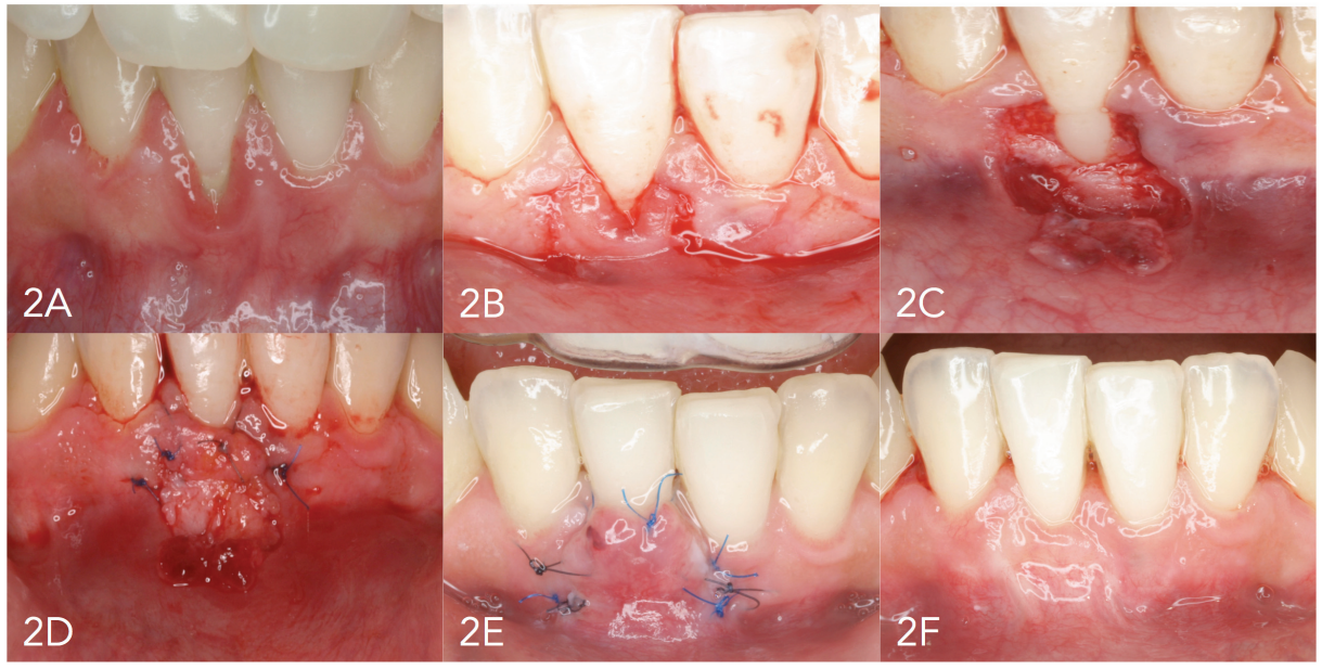
Fig. 2. 2A. Initial recession. 2B. Flap design. 2C. Raising of the partial thickness flap. 2D. Suturing of the connective tissue graft in the receptor bed. 2E. Flap suturing. 2F. Final condition after 18 months.

(and their variations) was homogeneous between the two study groups, i.e., to assess differences in the effect of the operation according to the surgical technique used. Lastly, an analysis was also made of the influence of other secondary variables referred to the patient profile, habits and clinical conditions upon the effects of the surgical treatment, with a view to identifying possible significant differences between the techniques.