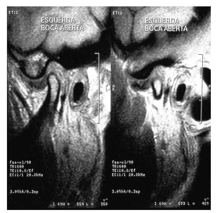
Fig. 1. MRI findings of Anterior disc displacement without reduction.

Concentrations of lubricin in the SF were measured using a commercially available ELISA system (Pierce Biotechnology, Rockford, IL, USA) as previously described, (10,11) following the manufacturer's instructions for the quantitative determination of lubricin. The assay sensitivity of lubricin was 3.25 pg/mL. Concentrations of lubricin less than minimal sensitivity were considered as 0 pg/mL. The level of lubricin was de-