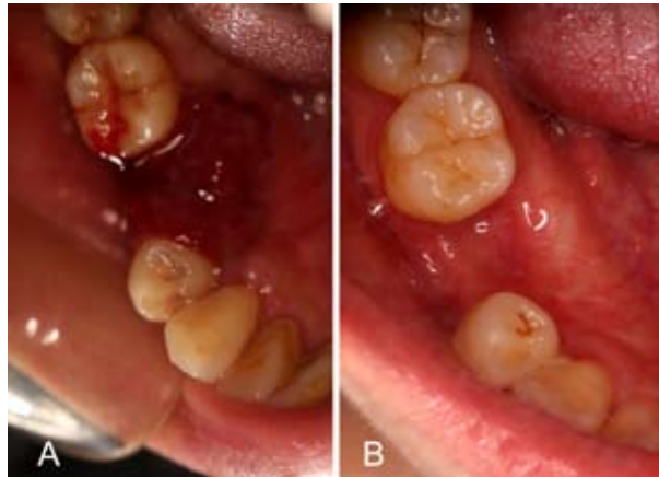
Fig. 2. (A) A bright red, easily haemorrhage and well-defined tumor at the gingiva of the right lower second premolar was relapsed after surgery. (B) The lesion was disappeared after four times intralesional injection of PYM.

Small haemorrhage occurred on the surface of the lesion after injection, which stopped bleeding for no more than 1 h. Slight swelling and pain occurred around the lesion on the second day following sclerosant injection; these symptoms resolved in 7 to 10 days. Approximately three days after injection, ulceration was observed on the surface of all of the lesions (Fig. 3), which vanished