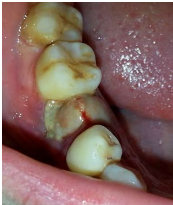
Fig. 3. The ulceration was found on the surface of the lesion about three days after injection.