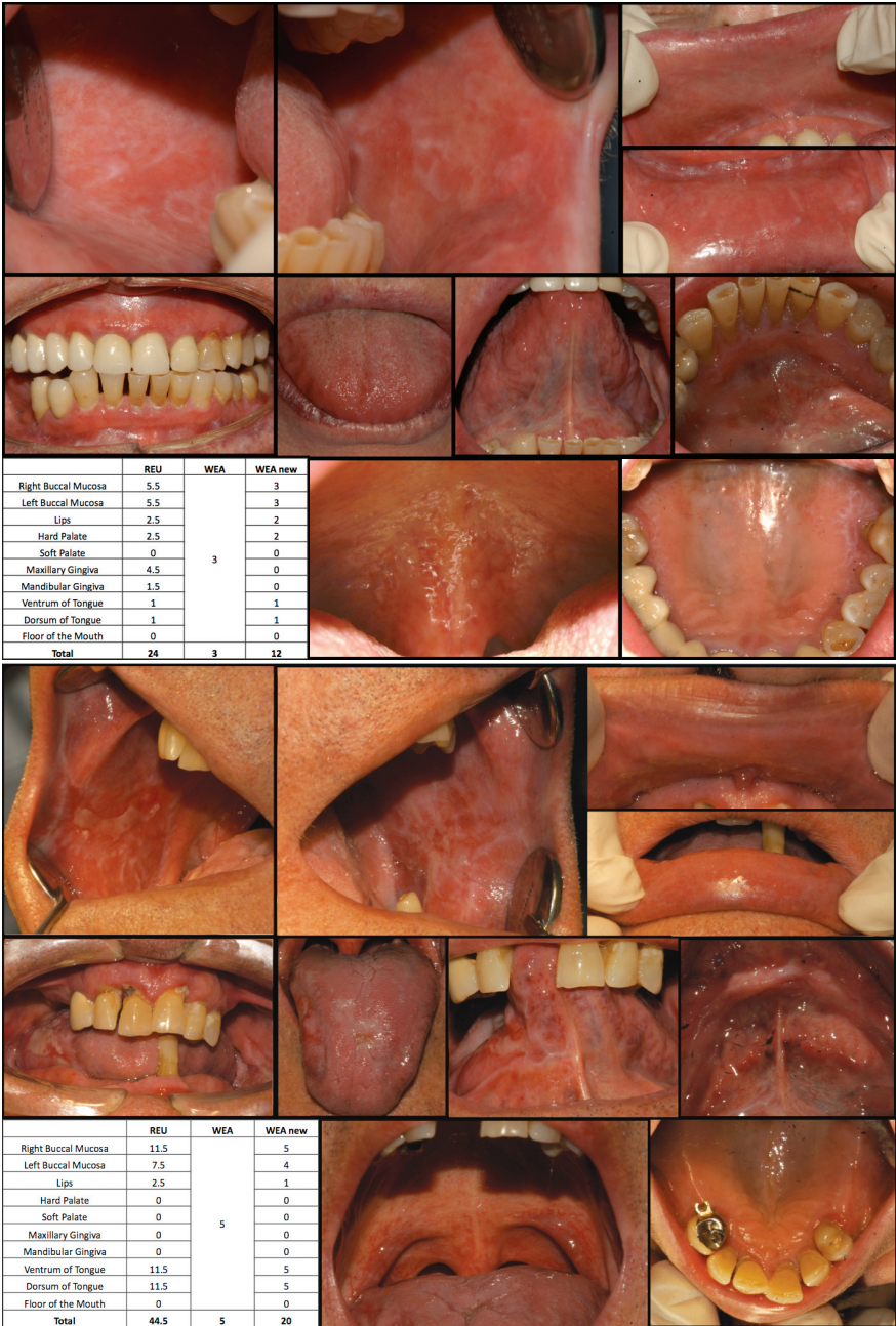
Fig. 1 and 2. Show how the patients were scored using the REU and WEA-MOD.

Data are presented as “number of patients (percentages)”. MILD: REU<10, WEA 0-1; WEA-MOD <8; MODERATE: REU 11-20, WEA 2-3, WEA-MOD 8-15; SEVERE: REU>20, WEA 4-5, WEA-MOD >15.