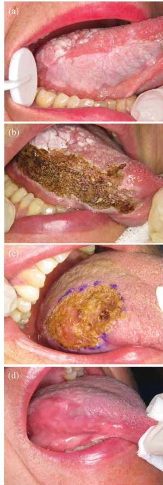
Fig. 2. (a) Non-homogeneous leukoplakia on the tongue mucosa of a 57-year-old female patient. (b-c) Treatment by CO2 laser vaporization. (d) Complete remission 1 year after laser vaporization.