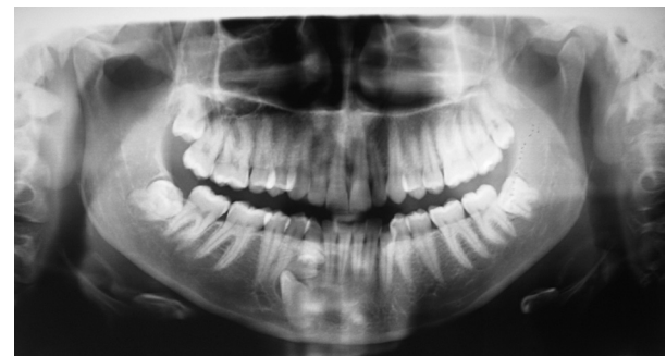
Fig. 3: Mandibular supernumerary canine in the fourth quadrant impeding the eruption of the canine.

One of the present study's objectives was to analyze the clinical consequences of SNCs. Türkahraman et al. (7) assert that an ST can produce esthetic and functional disorders. Nadal-Valldaura and Viader Codina (8) maintain that when impacted, SNCs may trigger the symptoms that typify impacted teeth in general. Follicular sac expansion/enlargement >3\text{mm} was evaluated as previous studies have considered this a relevant variable. Eliasson et al. (27) and Sewerin and von Wövern (28) studied follicular sac expansion >3\text{mm} in impacted mandibular third molars, concluding that although it was not common – 6% and 5.4 % respectively – histological analysis identified the presence of follicular cysts in these cases. In the present study, 15.38% (CI 95%:5,4%-32,5%) of SNCs presented follicular sac expansion >3\text{mm} ; however, we have no record of later follow-up monitoring to suggest further expansion of the follicular sacs involved. According to the scant literature available, in spite of the hypothetical relation between follicular sac expansion and its evolution into a follicular cyst, this can be considered unusual. Both